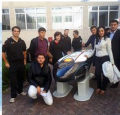
Prototype of the car on hydrogen fuel (Politecnico di Torino).

Participants have been acquainted with the structure of the University, levels and study programs at Bachelor's, Master's and Doctoral level; the areas of education and research in Politecnico di Torino; organization of Doctoral School and activities of Doctorate candidates; International relations of PoliTo, international students and foreign citizens, multilateral support for all types of mobility, from maintaining of language courses and informational support for these programs; support of scientific activity; case studies of PhD candidates, especially involved in MSCA programs; I3P Incubatore; Specializing Master and Lifelong learning School; Stage and Jobs Placement: the career service at Politecnico di Torino.